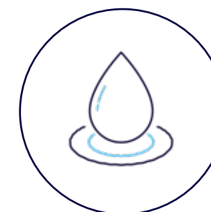
WATER HYGIENE MANAGEMENT