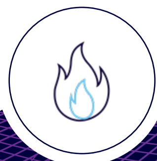
FIRE SYSTEM MANAGEMENT